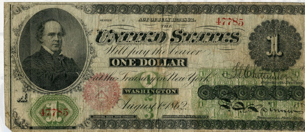
The Greenback in 1862. Demand modern Greenbacks!

mittee at that time and remains at the ready. Now is the time to make this important change”. 19